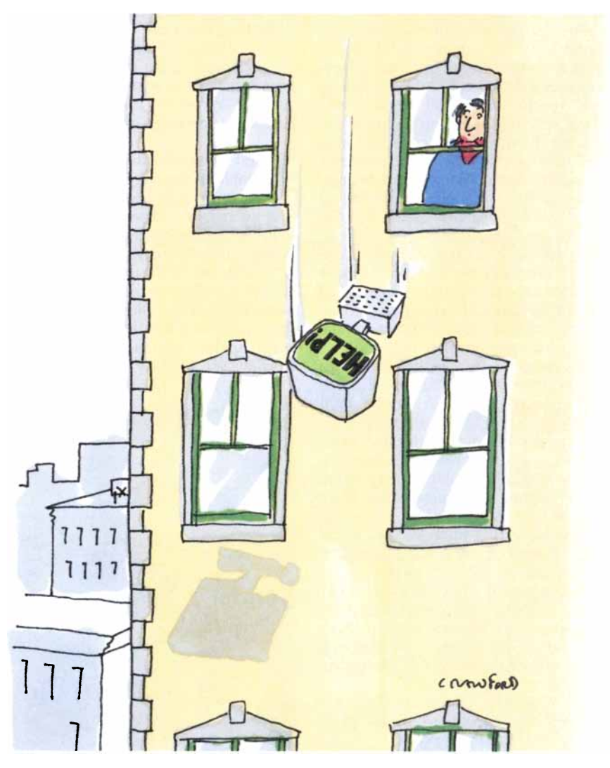
How could anyone have supposed that a computer simulation of a mental process must be the real thing?

Arguments from analogy are notoriously weak, because before one can make the argument work, one has to establish that the two cases are truly analogous. And here I think they are not. The account of light in terms of electromagnetic radiation is a causal story right down to the ground. It is a causal account of the physics of electromagnetic radiation. But the analogy with formal symbols fails because formal symbols have no physical, causal powers. The only power that symbols have, qua symbols, is the power to cause the next step in the program when the machine is running. And there is no question of waiting on further research to reveal the physical,