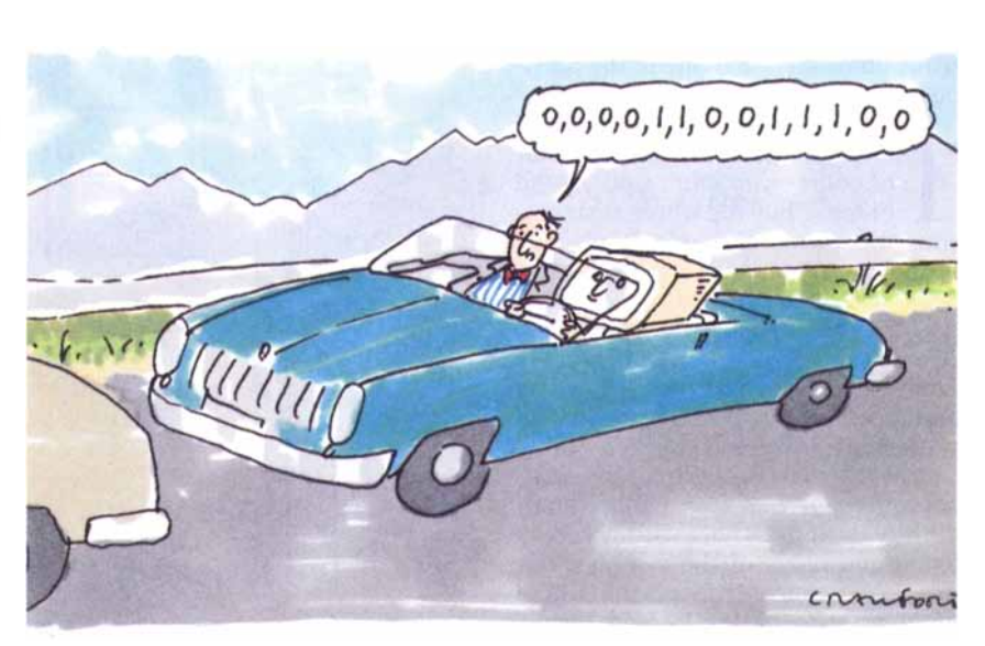
Which semantics is the system giving off now?

d. Semantics doesn't exist anyway; there is only syntax. It is a kind of prescientific illusion to suppose that there exist in the brain some mysterious "mental contents," "thought processes" or "semantics." All that exists in the brain is the same sort of syntactic symbol manipulation that